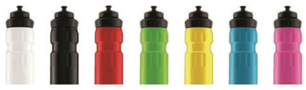
Figure 1. Seven images of a product in different colours

Once questionnaires had been scrutinized for completion and missing information, data were analysed by means of a statistical package SPSS,