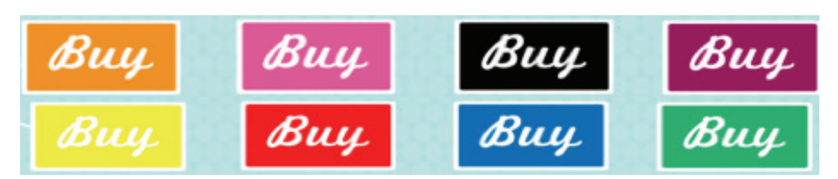
Figure 2. Banner in different colours